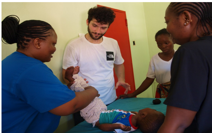
Team For Zambia - Team For Hope on service delivery with Hospital Physio team.